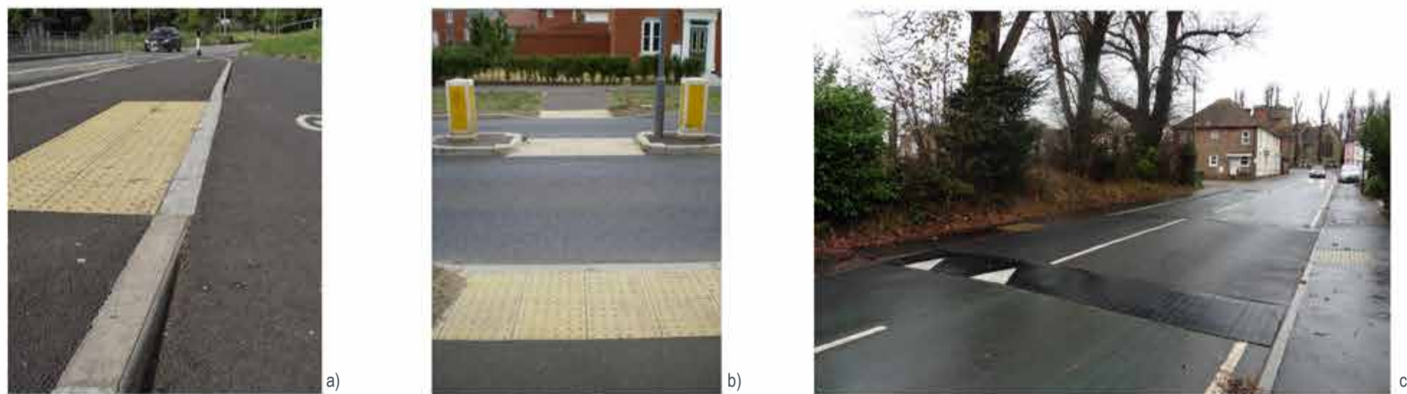
a) Typical dropped kerb with tactile paving. b) Typical crossing with central refuge area. c) Typical raised table. NOTE: Style/ design to be confirmed.