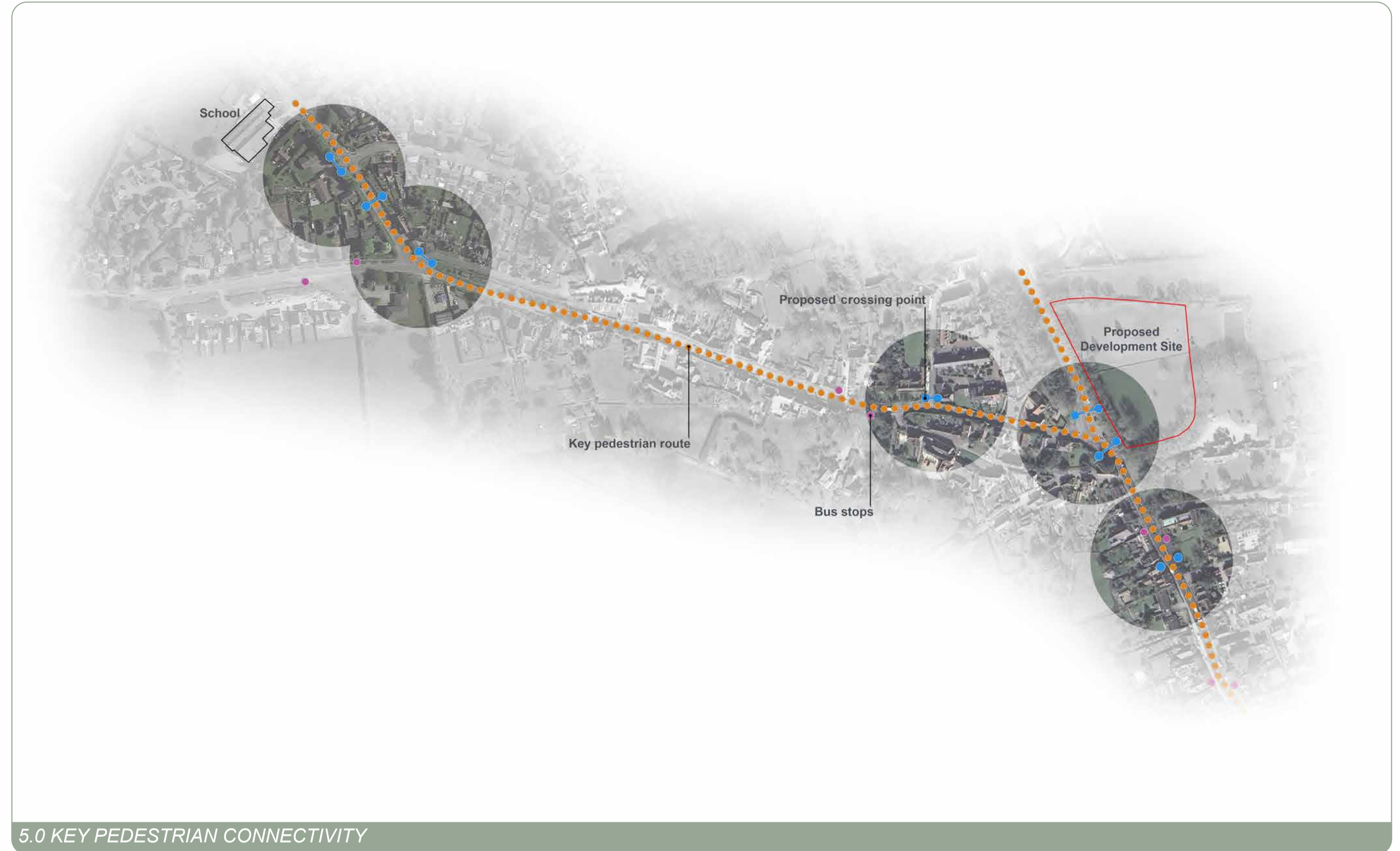
5.0 KEY PEDESTRIAN CONNECTIVITY